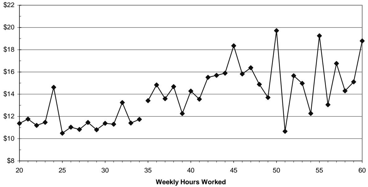
Figure 1b: Mean Wage by Hours Worked Among Men, 1995-2002 (in constant 2002 dollars)