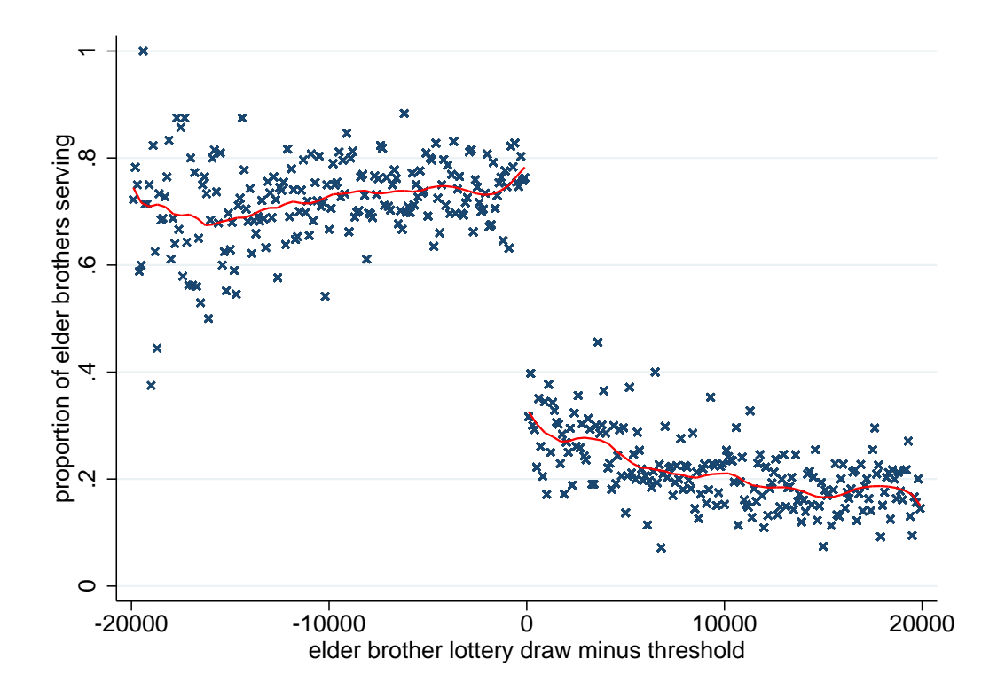
FIGURE 2. ELDER BROTHER SERVICE PROBABILITY BY ELDER BROTHER LOTTERY DRAW Notes : Crosses indicate proportions serving among bins containing 100 consecutive lottery draws above the threshold. The lines are (Epanechikov) kernel-weighted (second degree) local polynomials estimated on the bin proportions each side of the threshold.