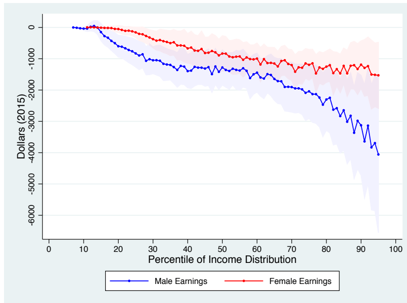
A. Impact on Male and Female Annual Earnings by Percentile, 1990-2014