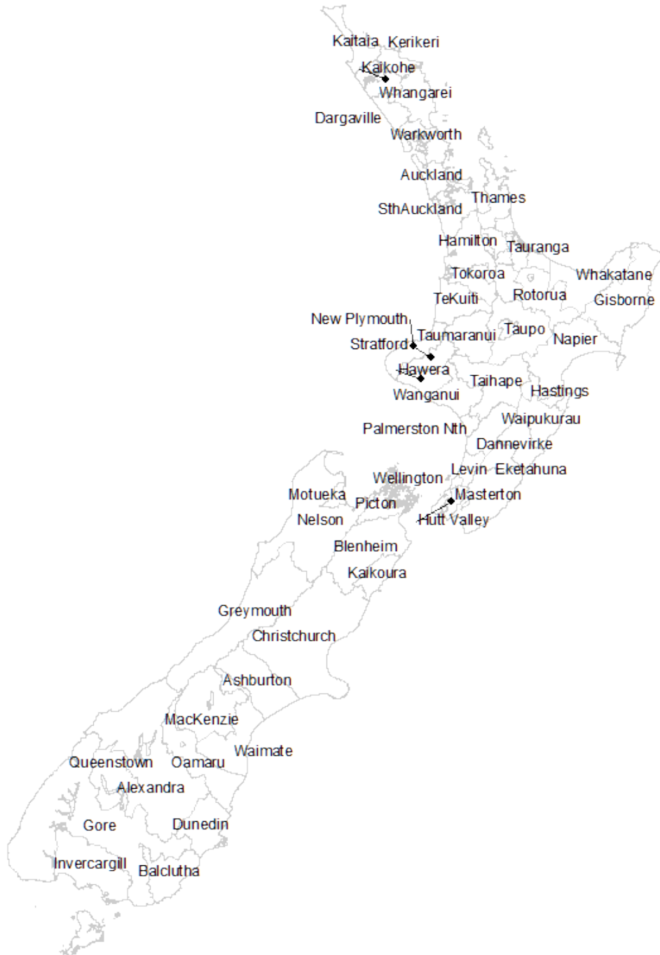
Figure 3. New Zealand Labour Market Areas