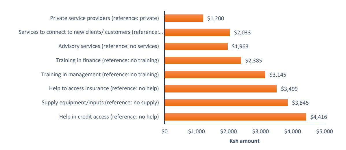
Figure 4: Services WTP

Self-employment . When it comes to self-employment, youth value above all financial services and, in particular, access to credit. The WTP for this service is estimated at 4,416 Khs or USD 43. This result is consistent with the hypothesis that youth face substantial credit constraints, also because of the lack of collateral and credit history. Youth seem to prefer credit even to the alternative of obtaining directly inputs and equipment. At 3,845 Khs, their willingness to pay for this type of service is 13 percent lower with respect to the WTP for obtaining access to credit. Access to insurance ranks third with a WTP of 3,499 Khs (Figure ).