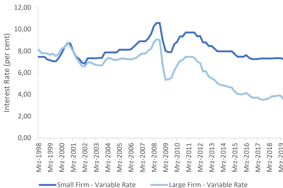
Figure.1: Variable interest rates charged to small and large firms.

in SMEs access to financial resources, particularly in fragile economies (e.g., Italy and Hungary). In Australia, the gap between the lending rates to small and large businesses has been constantly growing from 2002 to 2018, a trend that accelerated following the financial crisis. By 2018, small firms are charged almost double the interest rate charged to larger firms on their loans (Figure.1).