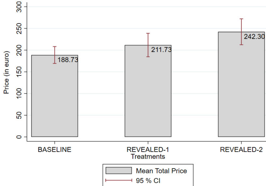
Figure 2: Average repair price conditional on the repair being successful

Notes: Average repair price per treatment in case of a successful repair (N=25 in BASELINE, 23 in the REVEALED-1 treatment, and 27 in the REVEALED-2 treatment, respectively). Average price (in euro) indicated in the top right corner of each bar. Error bars, mean \pm SEM.