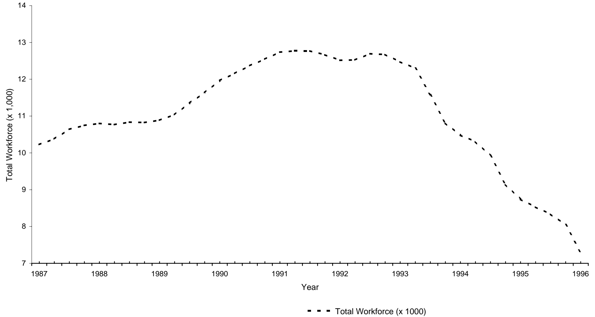
Figure 1: Evolution of a Workforce Fokker Aircraft b.v.